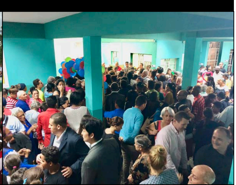
Feeding time at the First Cuban Festival - 2018