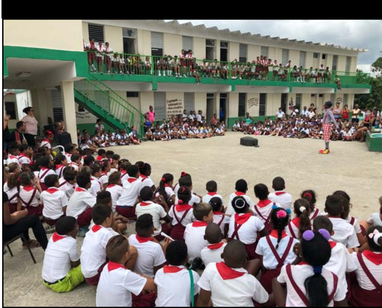
First Children's Program in Cuban School