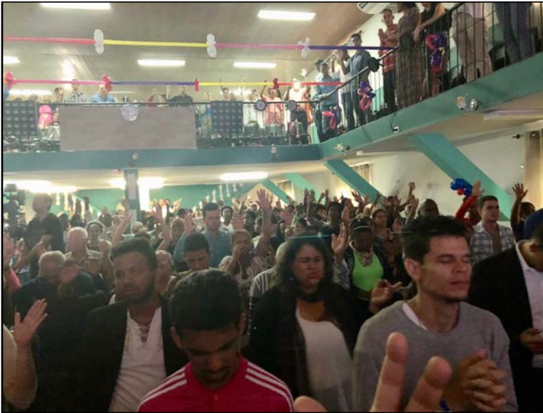
Packed house worshipping the Lord together BELOW: More amazing Worship and Celebration